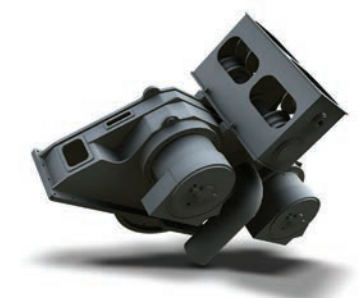
Direct drive crowd with integral fleeting sheave