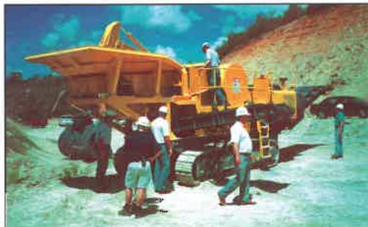
The BR350 Crusher being demonstrated at Burleigh Quarry during the National Sales Conference

The final day was spent at Burleigh Quarry, where In-Iron sessions