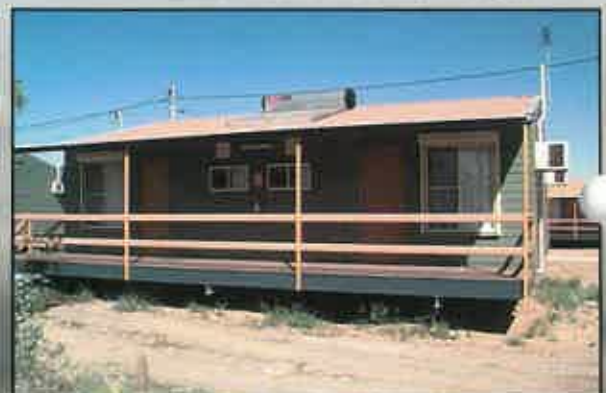
Home away from home. Living quarters on site.