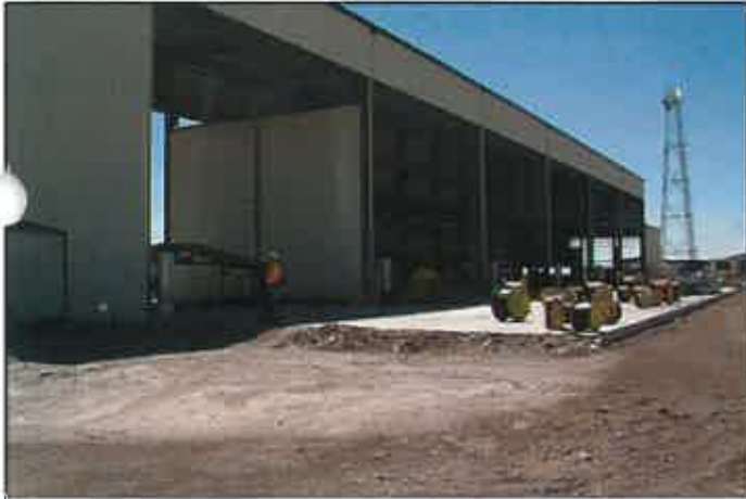
Workshop facilities under construction at the mine site.

Steve Green told us "The management team that has been set up is very experienced and capable of dealing with any difficulties and challenges during the initial start-up phase and through to completion of the contract. It is of the utmost importance to closely monitor the complete contract (fleet performance, response time, on-site inventory etc.) in order to exceed the customer expectations."