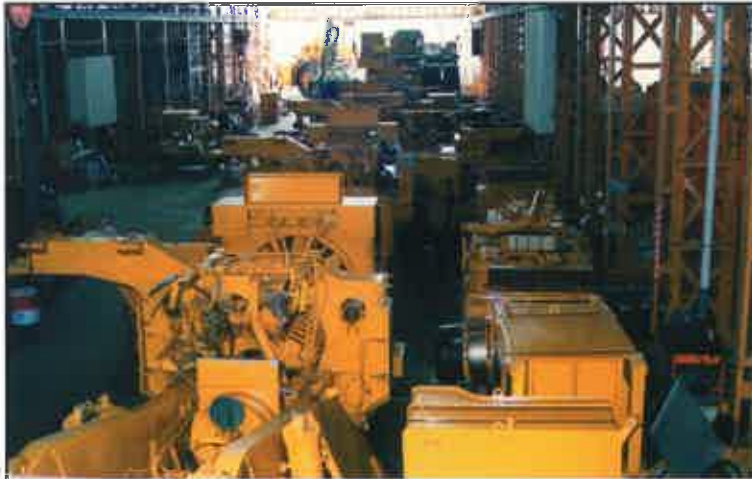
Dump Trucks being prepared by Brisbane Branch for Century Zinc.

there will be at least one machine to be serviced every day. The fleet will be on KOWA oil analysis and there will be scheduled change-out of components, based on machine condition monitoring.