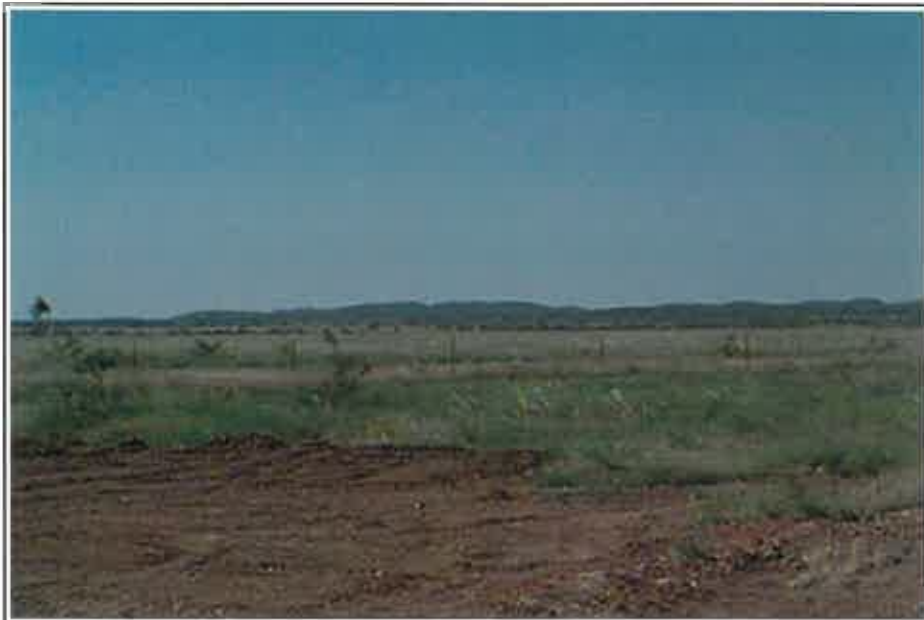
The Century Zinc Mine site 250km north west of Mt Isa North Queensland.

The Century Zinc mine, owned by Pasminco Ltd, is located 250 km north west of Mt Isa in the remote north of Queensland. Now under construction, it will be one of the largest zinc mines in the world, producing zinc, lead and silver, over the projected twenty-year life of the mine. The pre-strip period will see 70.25 million tonnes of material moved and then an initial mining rate of 82.5 million tonnes of material per year, over the first five years.