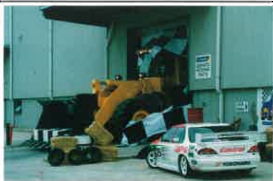
The WA600-3 emerges from behind a checkered paper wall with Komatsu Racing driver Alan Jones at the wheel.