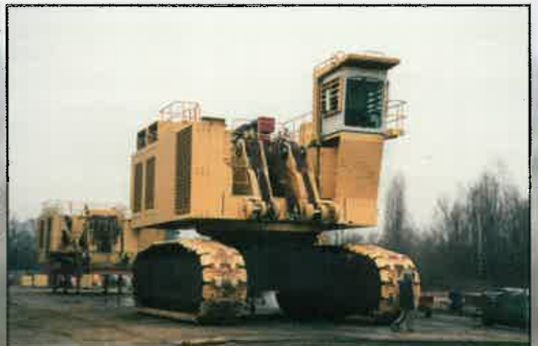
One of two Komatsu Demag H255S Shovels being prepared for Century Zinc.

"Down To Earth" extends congratulations to everybody involved in all phases of this project. We hope to provide further articles on the equipment and the people who look after them at Century Zinc, in future issues.