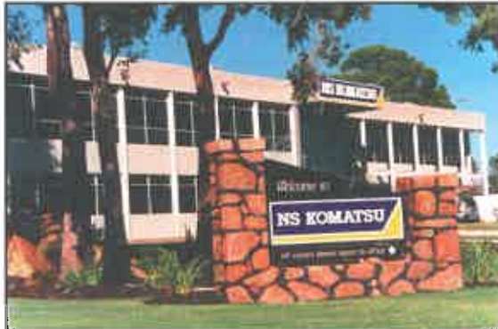
The new $13 million redevelopment of Western Region Headquarters

In February, NS Komatsu opened the new Western Region headquarters in Welshpool, Perth. Premier Richard Court officially opened the new facility before an audience of more than 300 customers and industry representatives.