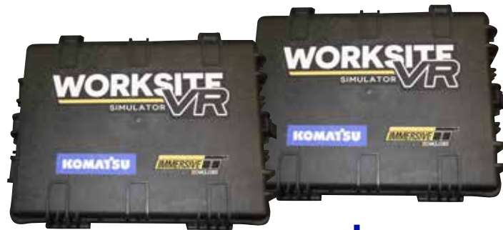
Two Transport Cases