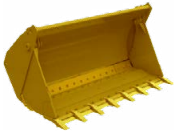
4 in 1 bucket