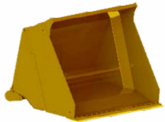
High dump bucket